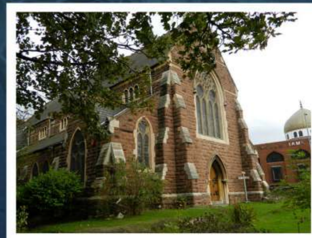
Modern day views of Holy Trinity Birchfield, courtesy of Anthony Pitts

Holy Trinity Church Birchfield, built in 1864, stands at the crossroads of Birchfield Road and Trinity Road. Part of the parish of Handsworth, Birchfield was part of the county of Staffordshire until 1911, when it became by incorporation a suburb of Birmingham, and part of Warwickshire.